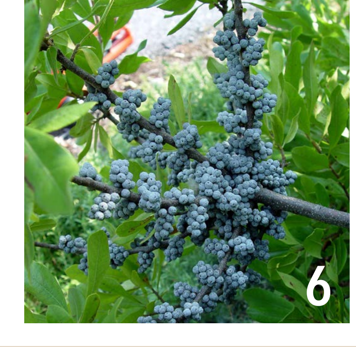
Bayberry is a salt-tolerant shrub that flourishes along sandy shores. It retains leaves and fruit well into winter, providing food and shelter to late-season birds.