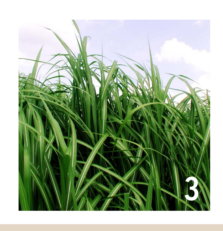
Switchgrass is a hardy and dense native grass, holding soil against erosion and providing year-round wildlife shelter.