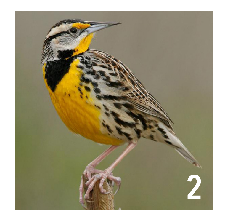
Eastern meadowlarks breed in nests on the ground covered with woven grasses, and forage along the ground and in low-lying vegetation.