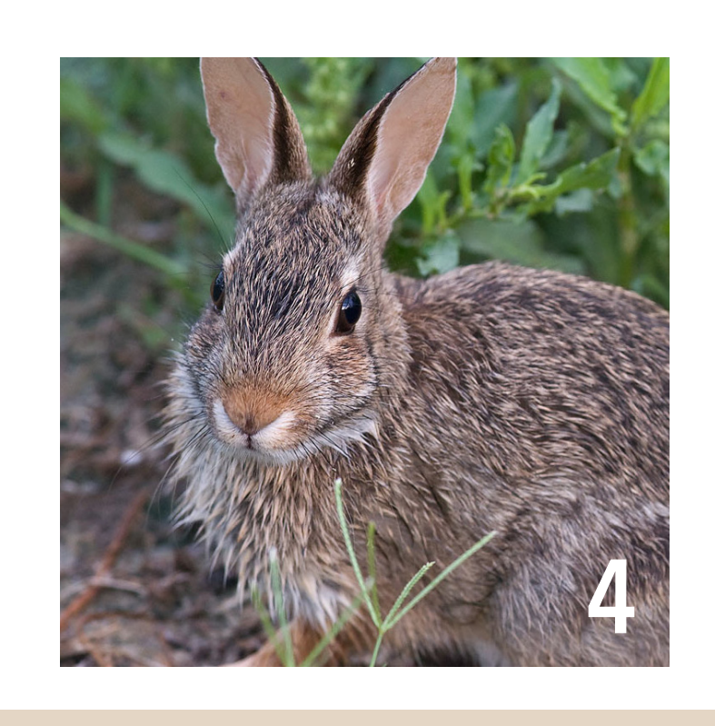
Eastern cottontail rabbits are found in meadows and shrubby fields that provide cover, feeding upon the many native species growing there.