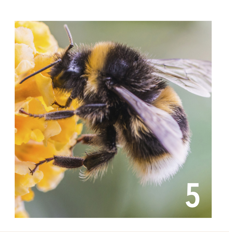
Bumblebees are among more than 100 species of bees in Connecticut, important as pollinators in sustaining the plants on which they rely.