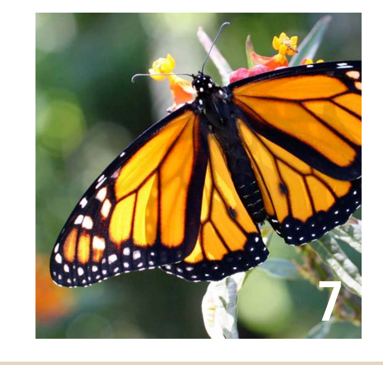
Monarch butterflies depend on Milkweed as host plant for its larval and caterpillar phases and, as butterflies, for nutrients before their long winter migration south.